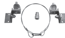
ADJUSTABLE MOUNTING KIT 5022